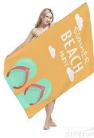
Microfiber beach towel