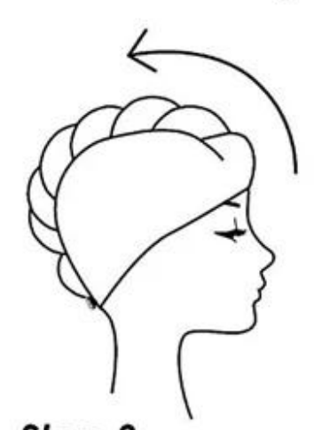
Step 3 Loop & Button

Hand or machine wash warm water with mild detergent, tumble dry low temperature. Do not use bleach of fabric softener, do not iron, and do not dry clean.