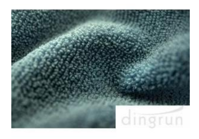
Manufacturer of cleaning towels