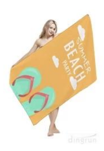
Microfibre beach towel