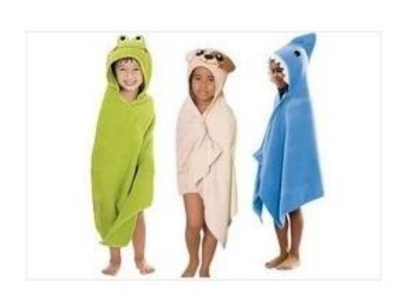
baby towel with hood