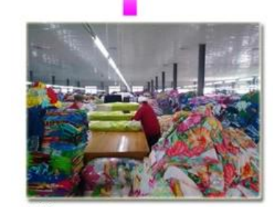
品检 product inspection