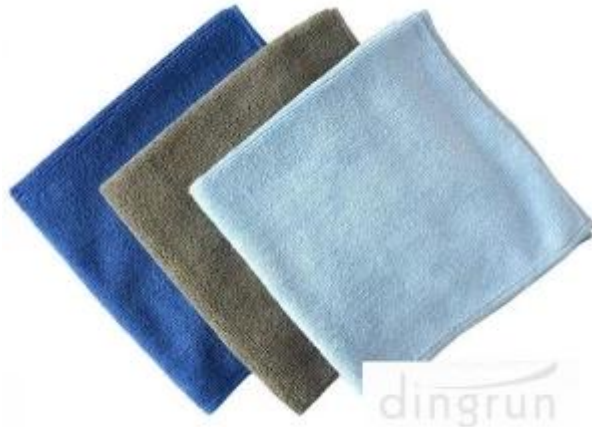
Supplier of microfibre car cleaning cloths