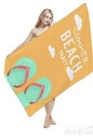
Microfiber beach towel