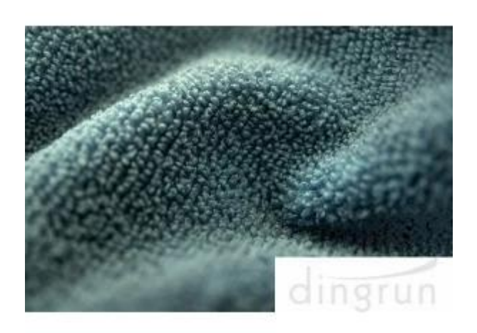
Manufacturer of cleaning towels