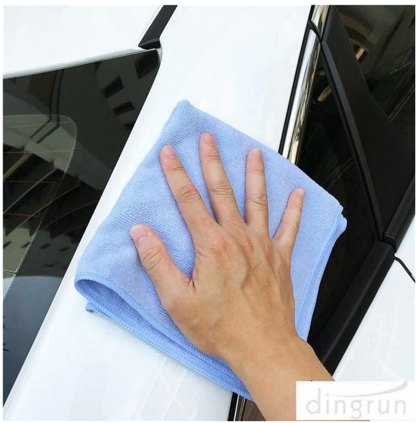
Gently cleans, removes dirt and grime like a magnet. Super absorbent, it contains up to 5-6 times its weight in liquid realistically, based on our tests. Cleans without chemical agents, leaves results without lint and without leaving streaks.