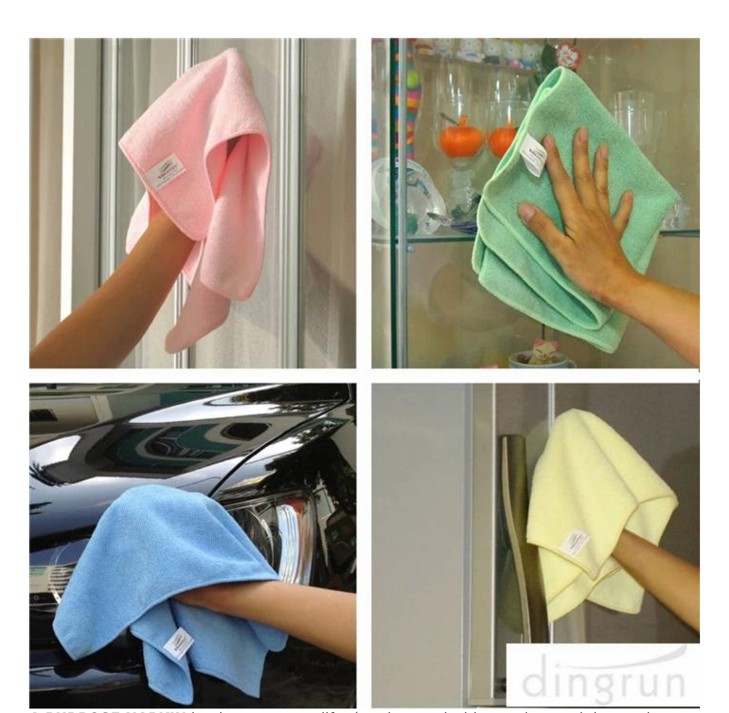
A PURPOSE NAPKIN it adapts to many life situations and with two sizes and three colors available: