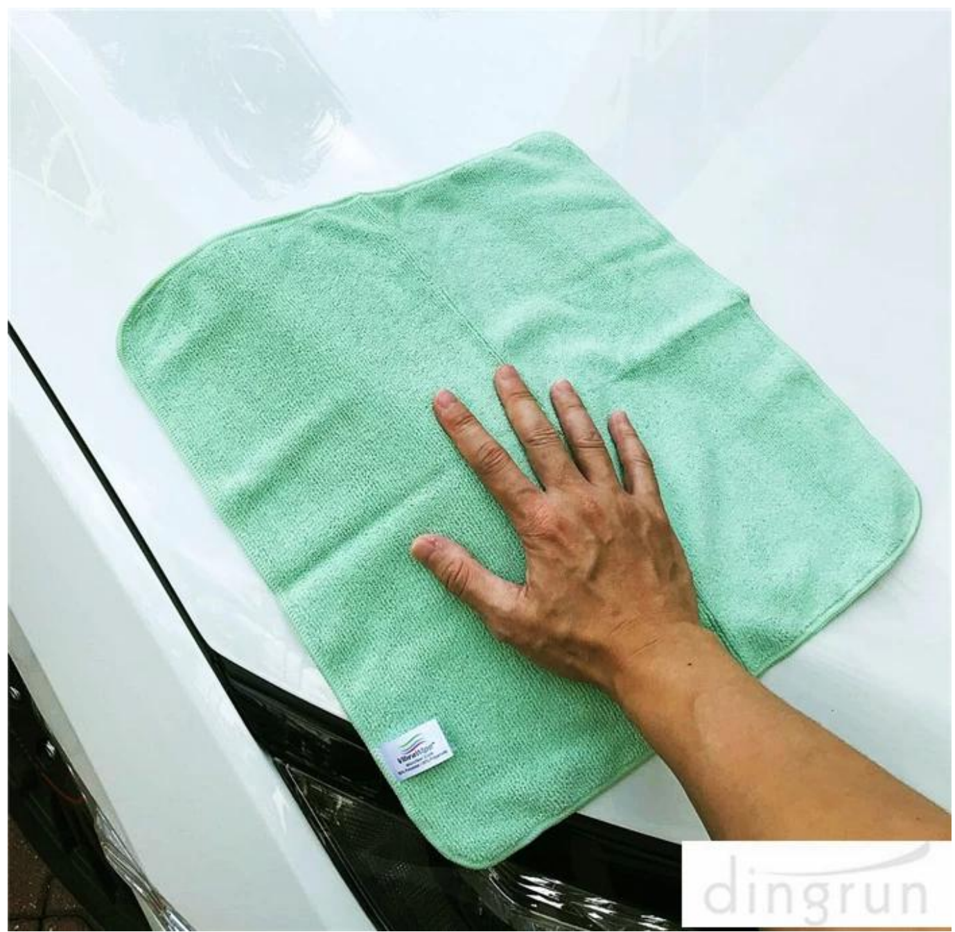
Hand or machine wash is ok, dry over medium heat. All microfibre towels lose their softness due to prolonged use or cleaning.