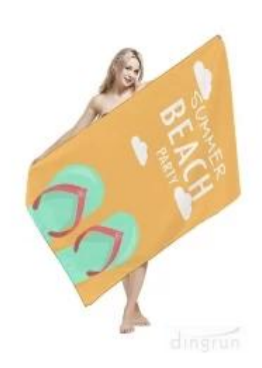
Microfiber beach towel