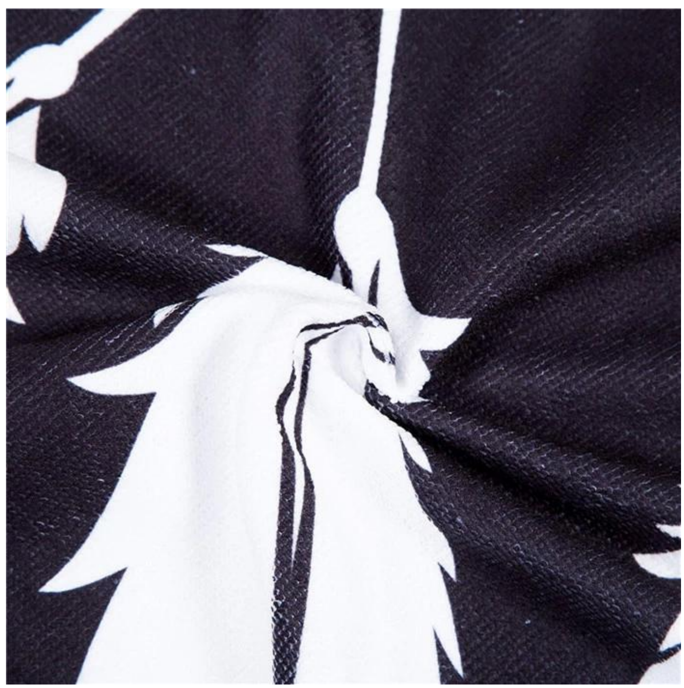
Premium Material: 100% durable microfiber absorbing almost 5 times more water than cotton. Ultra soft, comfortable, easy to store, and dry quickly.