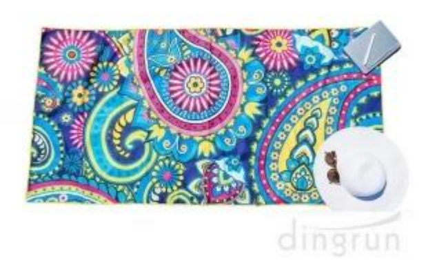
Microfiber beach towel factory