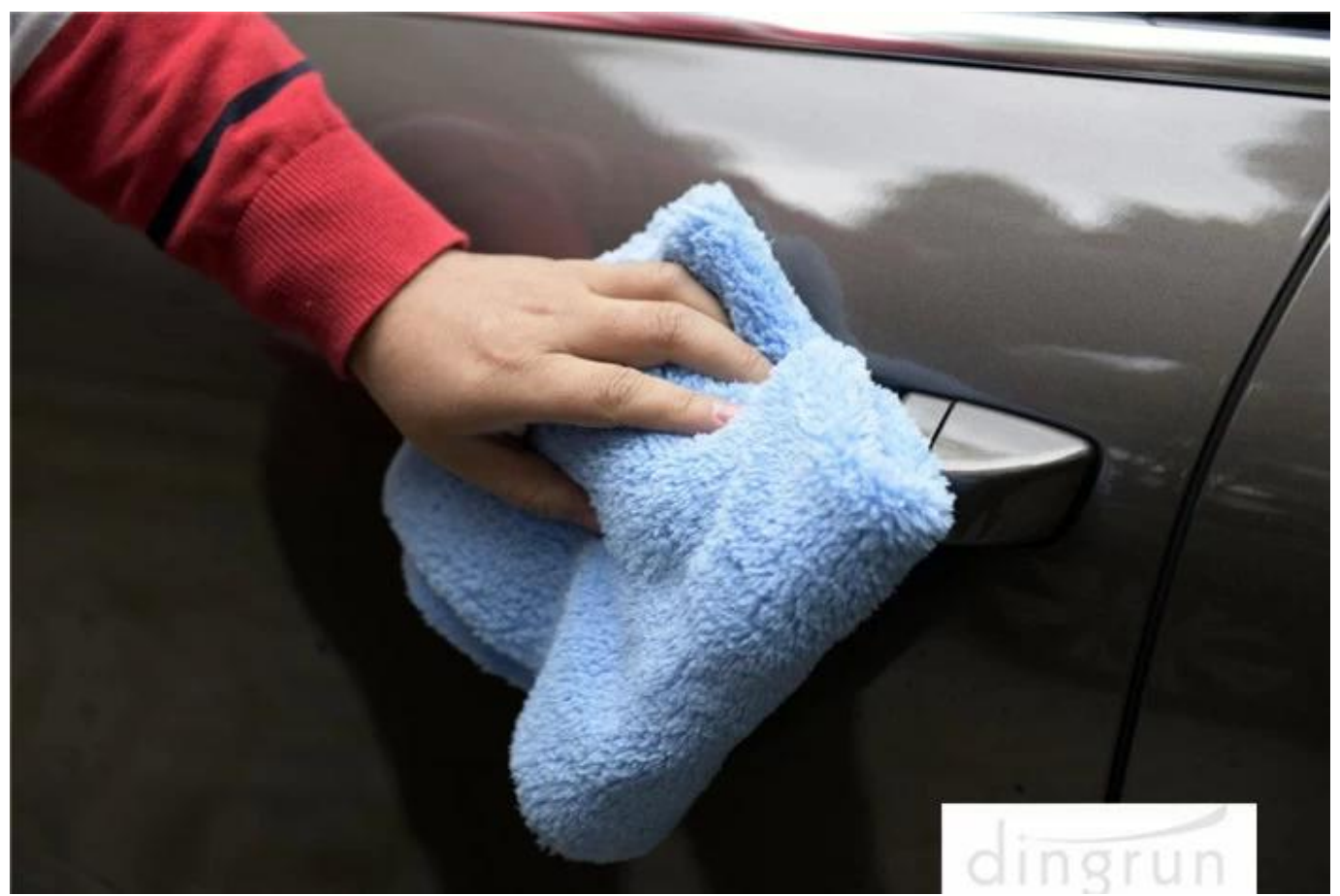
ULTRA ABSORBENT, SUPER SOFT: These water absorbing car drying towel have dual-sided plush, which can absorbs two times more than traditional cleaning microfiber, so you can greatly reduce the drying time.