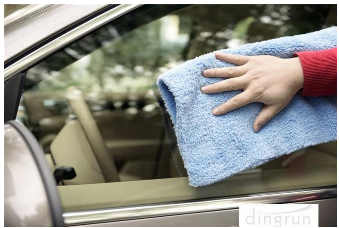
A PURPOSE NAPKIN it adapts to many life situations and with two sizes and three colors available:

MULTIPURPOSE: These microfiber towels can be used as car wash towels, window glass cleaning towels, car drying towel, auto polishing buffing towel, finishing towel.