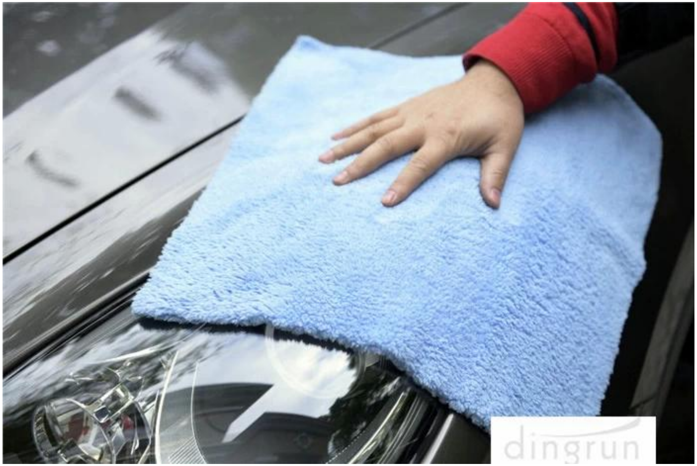
PROFESSIONAL GRADE MICROFIBER CLOTH: Made with premium 450 gsm microfiber which have the softness, absorbency and strength. This plush microfiber towel is extra thick, you can really feel the difference.