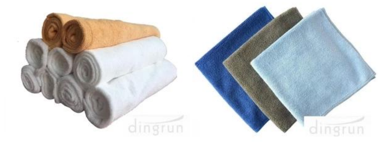
Manufacturer of cleaning towels