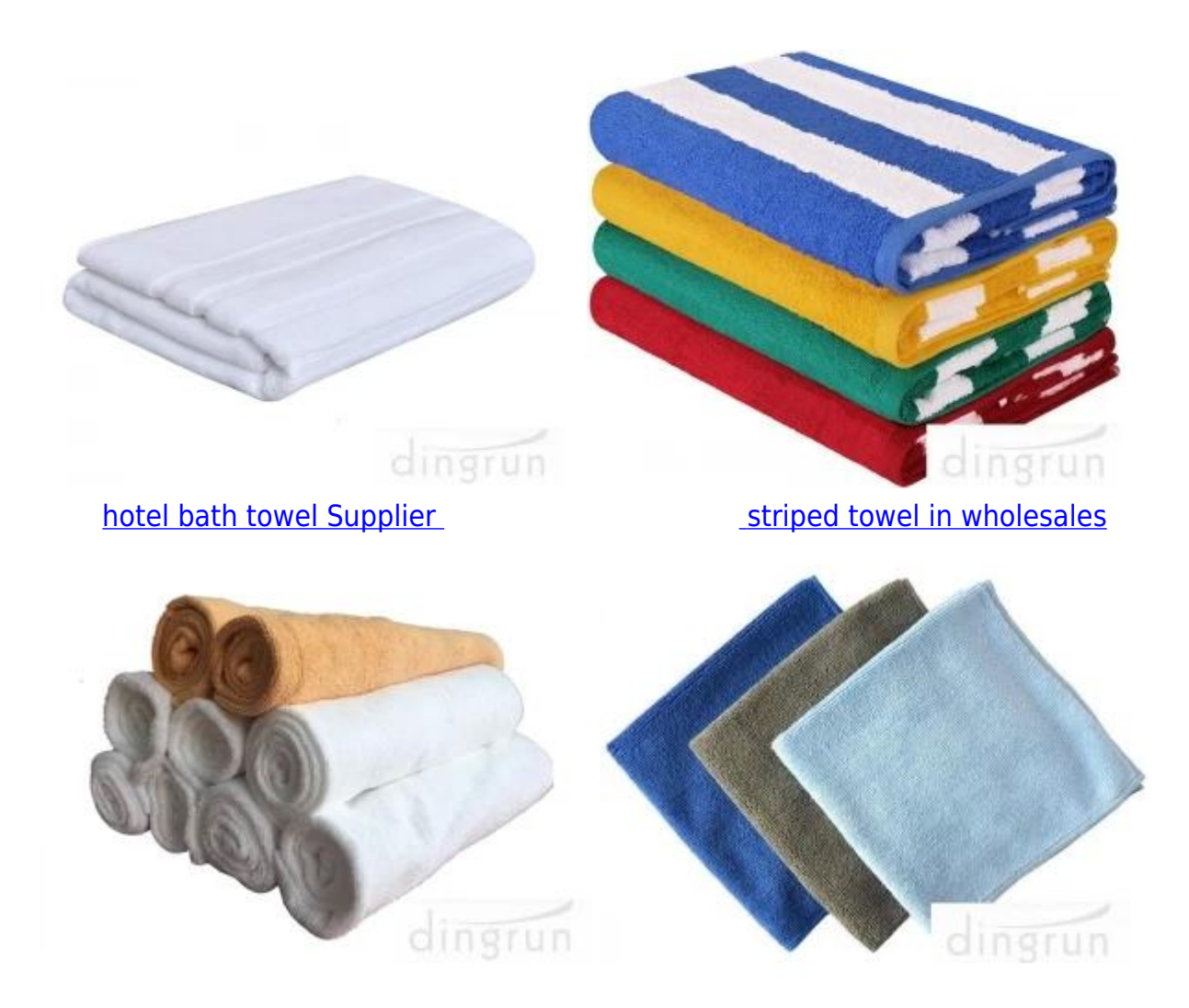
Cleaning Towel manufacturer