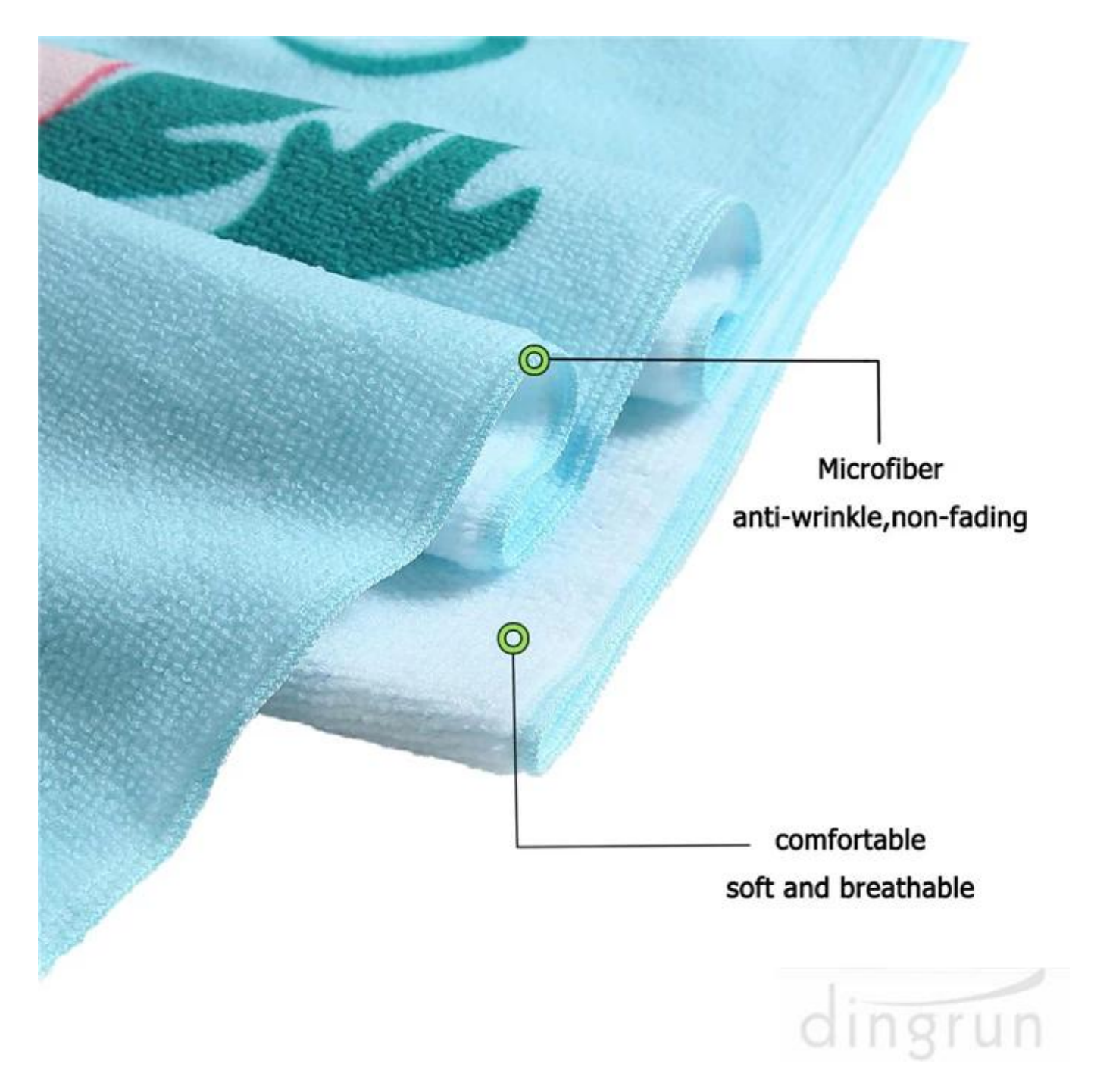
SOFT & BREATHABLE KIDS HOODED TOWEL: Microfiber.It is soft and comfortable,anti-wrinkle,non-fading and strong absorbent.