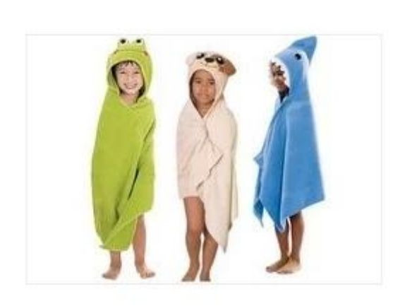
kids hooded towel