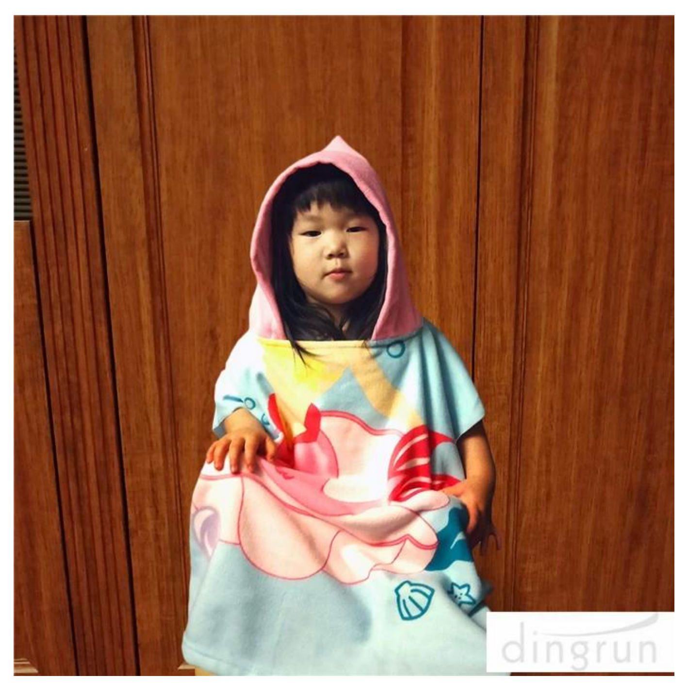
MULTI-USE: Great for your lovely baby or child using it at home for bath time fun, after swimming or for fun day at the pool or the beach.

We produce all kinds of bath robe, bathmat, hand towel, facetowel, hair towel, blanket, mattress, pool towel, bedsheet, pillow case.