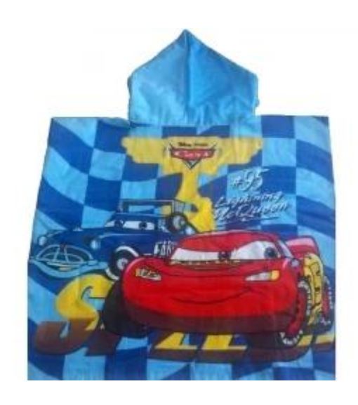
child poncho factory