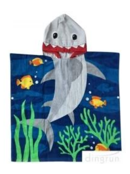
kids bathrobe in wholesale