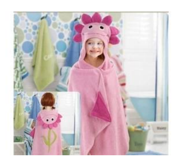
kids hooded beach towel manufacturers