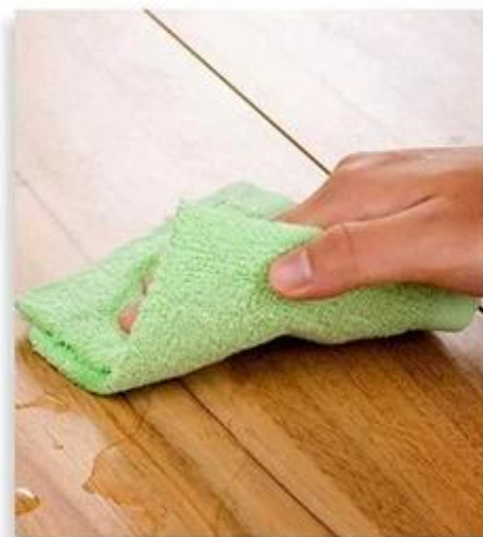
● Absorb large spill