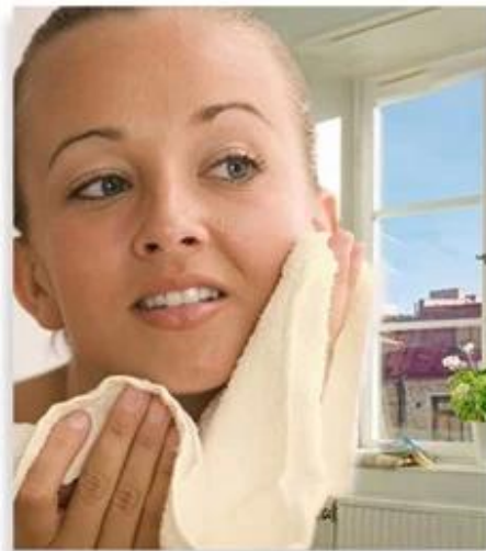
● Use as facial towels