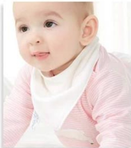
● Use as baby bibs