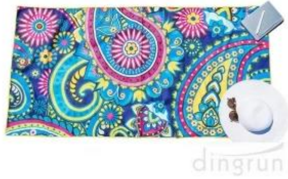
microfiber beach towel exporter