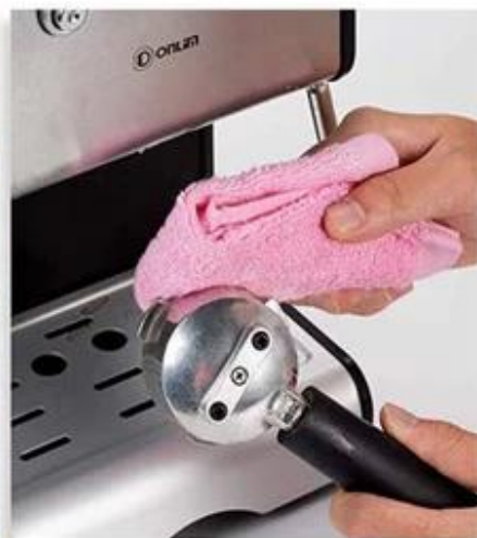
● Use on kitchen utensils