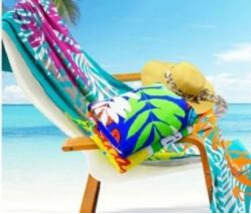
beach towel manufacture