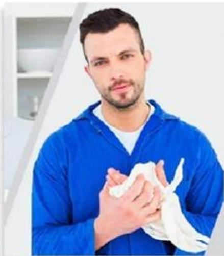
● Use as handkerchief