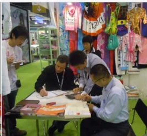
April 19-22, 2011 Hongkong Spring houseware Fair