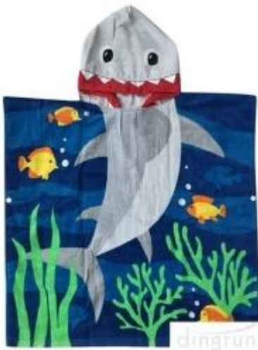
roupão de crianças na venda por atacado toalha