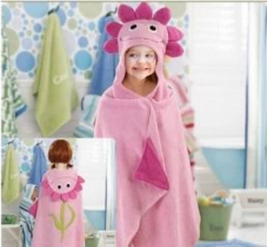
fabricantes de toalha de praia com capuz