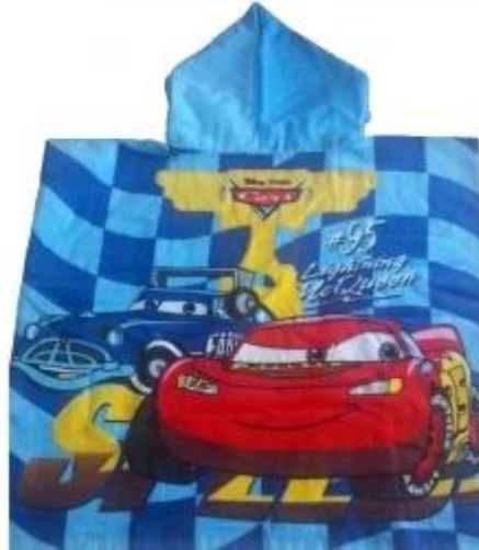
fábrica de poncho infantil