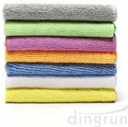
Производитель полотенец из микрофибры пляжных полотенец