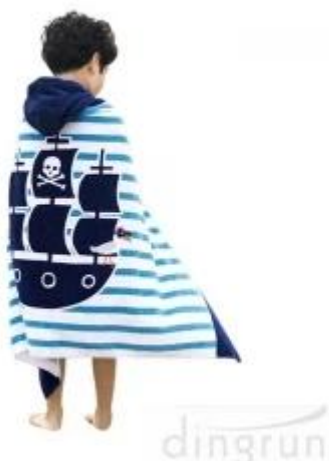
Пончо с капюшоном