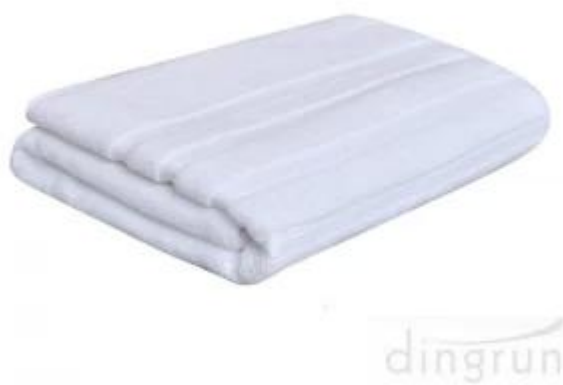
Поставщик полотенец для ванной